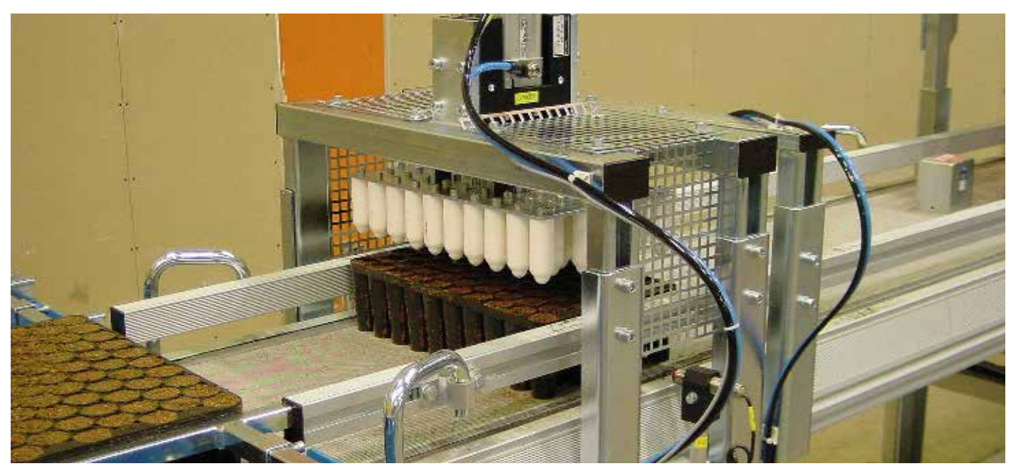
dibbler plate is easily exchangeable when switching between tray types