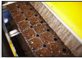
less than 5% variation in cellweight