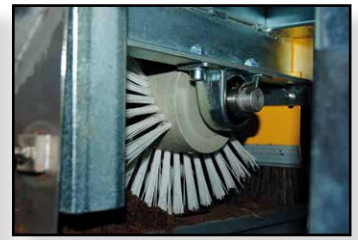
excess media removed from the tray