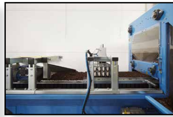
fast and accurate filling